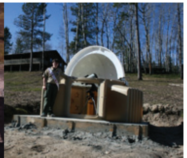
Check out all the photos from the Lodge Astronomy Dome build at www.pa-hin.com